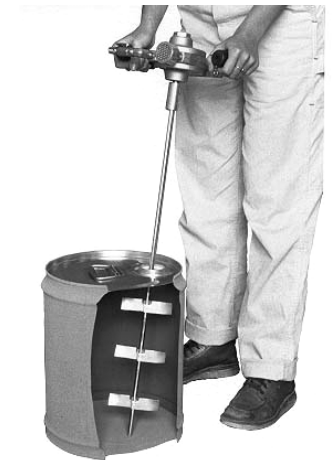
Optional Pail Mixer

DM-05SSM, High efficiency bung entering drum mixer suitable for 1 to 25 gallon containers